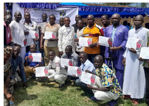
Central African Republic